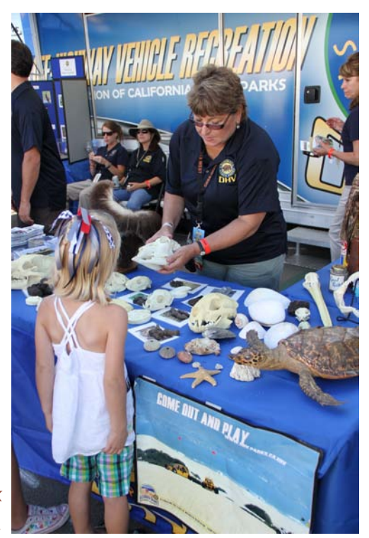
Without public support, park management goals will fail.

There are many benefits to providing interpretive messages regarding the management of the resource and we'll discuss them in more detail later in this module. In addition, interpreters must consider the many different motives that bring visitors to the programs. A successful park-wide interpretive effort will include a variety of messages, programs, and communication techniques.