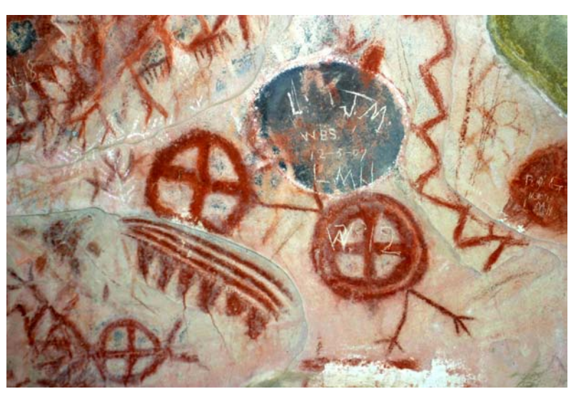
Most depreciative behavior occurs not out of malice, but out of ignorance.

A second reason to attempt to control behavior through interpretive means is that recreation areas and parks are considered some of the last places that humans can be free. To escape the rules and restrictions of society is one of the driving factors that push people into the outdoors (Knopf, "Human Experience of Wildlife: A Review of Needs