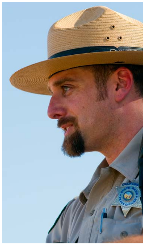
Interpretation is a valuable tool for generalist park rangers.

We connect the visitor to the resource by developing interpretive programs that address California State Parks in one or more of these four areas: cultural resources, natural resources, recreational resources, and our agency values or management. In all four areas, the interpreter is challenged to go beyond merely teaching facts to revealing meanings that are relevant to the audience.