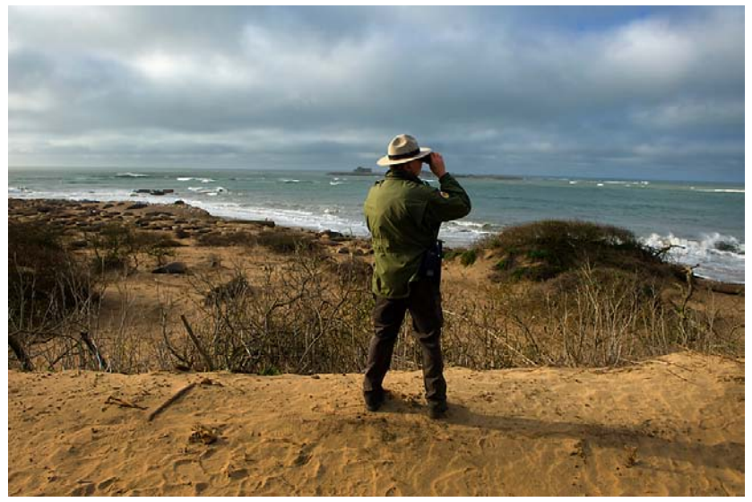
Becoming an expert on the nature of your park means spending as much time out in it as possible

Build on your experience-based knowledge by reading a wide variety of sources of written information about your park's resources. Don't rely on the same book that everyone uses. Read that book or article and find three more. Talk to other park staff. The greatest wealth of knowledge about a park is often held by senior rangers, scientists,