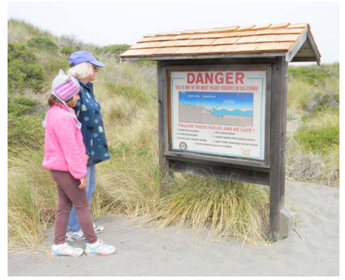
Visitors must recognize the dangers and understand how to keep themselves safe.

In addition to protecting the visitors' experience, we must also protect their physical safety. This is