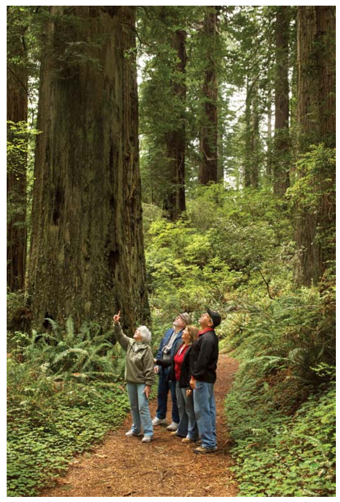
Why should your visitor care about redwood trees?

These are all intangible meanings. The interpreter can help the audience see the meanings beyond a single tree. Of course, you can't put all that information and all those meanings into one talk on redwoods, or you'd give your audience a collective headache. The interpreter has to pick and choose his facts and stories, his tangible resources and intangible meanings—based on his knowledge of the park, his knowledge of the audience, and his ability to apply interpretive techniques. More about the audience will be covered in Module 3—Communication , and throughout this course, you will be exposed to interpretive techniques that have been used successfully by rangers, lifeguards, interpretive specialists and skilled volunteers throughout our parks.